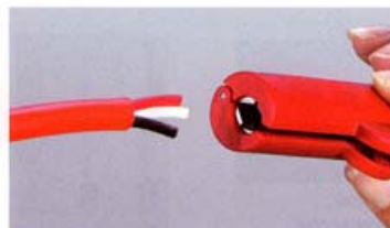
用于 3 × 0.75mm 2 的 PVC 圆电缆的剥皮 Stripping used for 3 × 0.75mm 2 PVC Circular cable