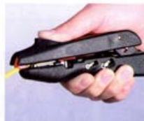
用大拇指按住向前推 Press down with thumb and push ahead.