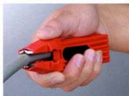
剥离护套的电源线 25mm 2 以下 To strip the power cord with sheath under 25mm 2