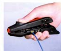
压接时用大拇指向前推即可 Push forward with thumb when crimping