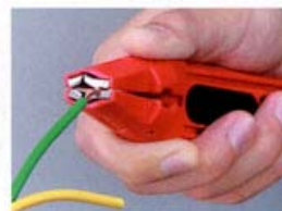
剥单芯电源线。剪断电源线 Stripping power cord with single core, Cutting power cord