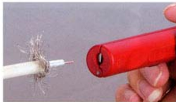
适用于剥除直径 4.8-7.5mm 的同轴电缆 Applicable for coaxial cables in the stripping diameter of 4.8-7.5mm