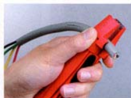
纵向剥带护套电源线 Longitudinally stripping and cutting power cord with sheath