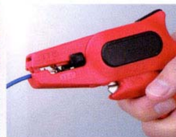
Strip power cord