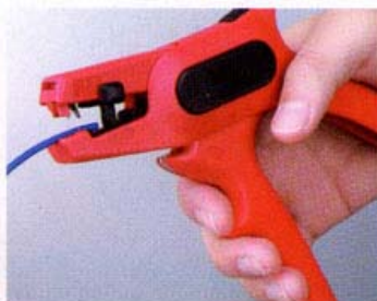
Adjust the dimension of stripping power cord