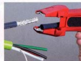
用于同轴电缆的导线剥皮 For the stripping the conducting wires of coaxial cables