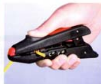
导线最大剪切横截面 Maximum shear cross-section of conducting wire