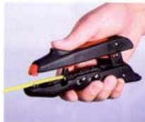
根据需要的长度剥线 Stripping is based on the required length.