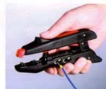
根据管形端子的大小选择压接口 Select clamping nozzle according to the size of pipe terminal