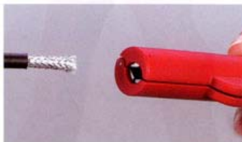
直径 5.0~15.0mm 的 UTP+STP 数据电缆的剥皮 The stripping of UTP+STP data cable in the diameter of 5.0~15.0mm