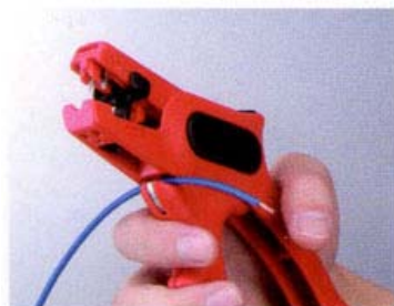
Cut off power cord