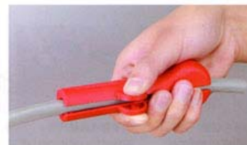
双壳体叠合式剥皮工具 Double-shell laminated stripping tool