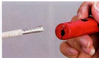
用于同轴电缆的导线剥皮 For the stripping the conducting wires of coaxial cables