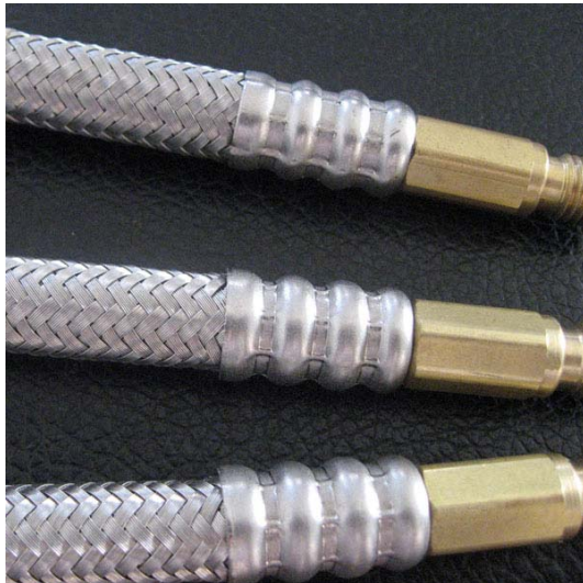
Crimp Type 1: