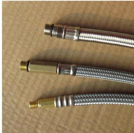
Crimp Type 2: