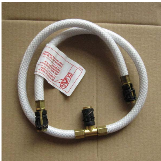
Crimp Type 3: